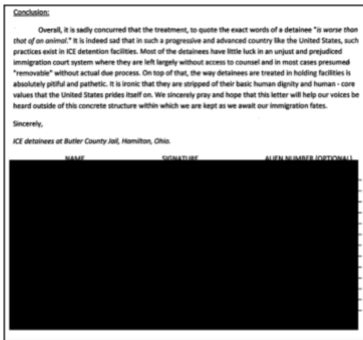
Excerpt of letter from men in Butler County Jail; redacted

The letter is addressed, “To anyone who will listen to us.” Recounting multiple violations of ICE detention standards—from guards who failed to furnish immigration forms and writing implements as instructed by a judge to being locked in their cells for twenty hours a day with no outdoor access.