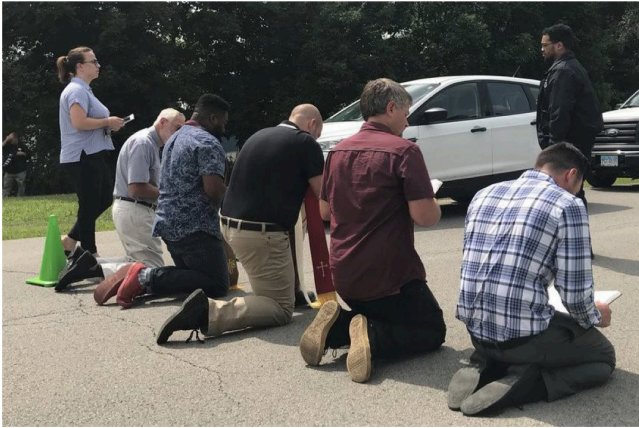
Protestors kneel at the Northeast Ohio Correctional Center.

outreach. And the release of three Mauritians from NEOCC marked a turning point in that anti-deportation campaign.